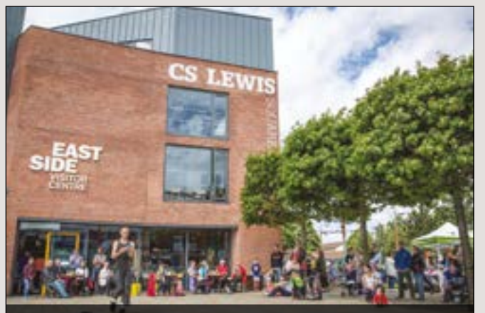
EastSide Visitor Centre, opened August 2016